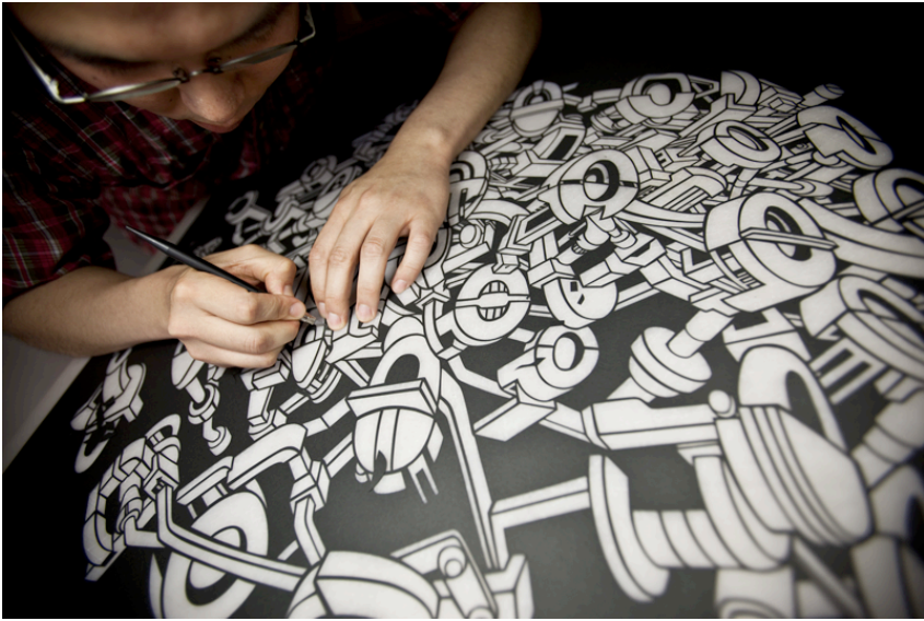
Images clockwise: BODY 3, BODY 26, Portrait: Mikito Ozeki creating paper cutout.